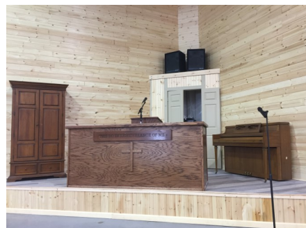
Miracle Baptist's New Pulpit Area